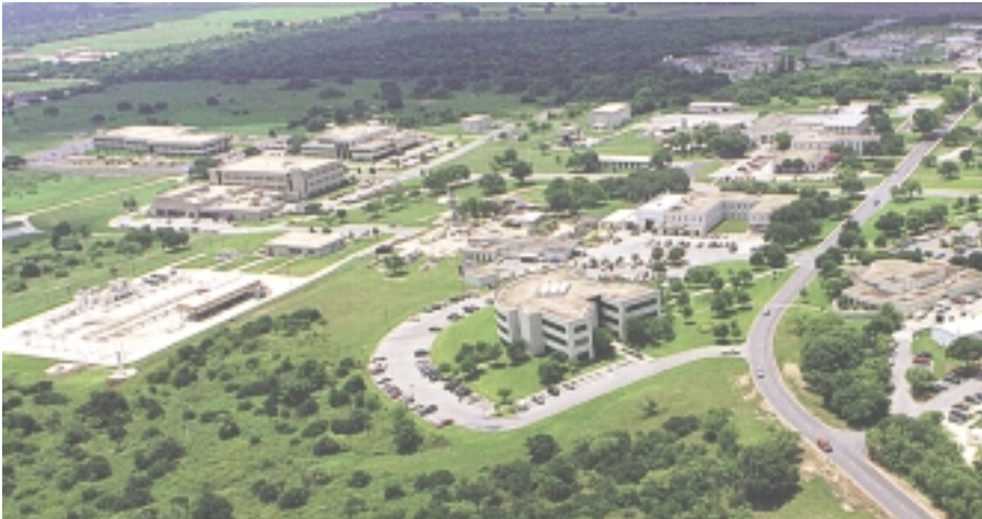
Southwest Research Institute® is an independent, nonprofit, applied engineering and physical sciences research and development organization using multidisciplinary approaches to problem solving. The Institute occupies 1,200 acres in San Antonio, Texas, and provides nearly two million square feet of laboratories, test facilities, workshops, and offices for more than 2,900 employees who perform contract work for industry and government clients.

We welcome your inquiries. For additional information, please contact: