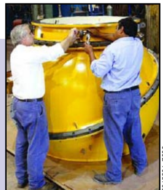
50-in ID, 24-ft long, 6,500-psi deep ocean test chamber at SwRI