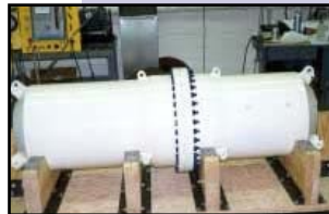
Undersea Electronics Equipment Chamber

Benefiting government, industry and the public through innovative science and technology