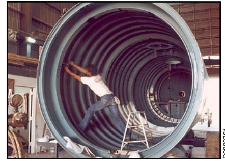
SwRI built the Kokanee submarine, the largest unmanned sub in the world (roughly 100 feet long and 10 feet in diameter), to simulate the acoustic and hydrodynamic characteristics of the Seawolf Class attack submarine. All structures, foundations, and control planes were designed and fabricated at SwRI.