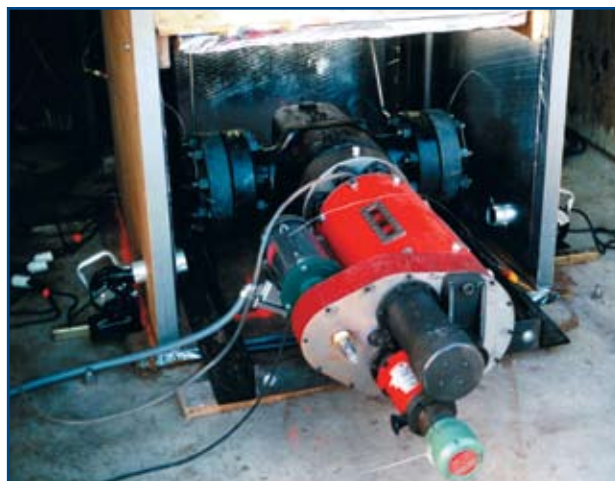
Valve and hydraulic actuator assembly undergoing low-temperature (-50°F) test