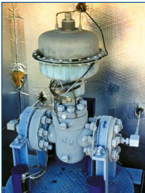
Valve and electrical actuator assembly in test fixture for API-6A test