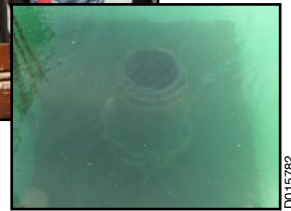
SwRI performs functional testing and evaluation of full-size subsea equipment.