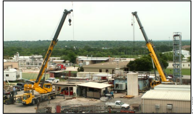
SwRI has a variety of outdoor facilities to perform deep ocean simulation testing and structural load testing.

For more than 50 years, Southwest Research Institute® (SwRI®) has supported the oil and gas industry with structural engineering services including drilling systems, completion systems, and transportation systems. SwRI engineers have the expertise and comprehensive understanding of the industry to help investigate and solve complex problems. SwRI staff members have provided research, testing, design, analysis and fabrication services on a multitude of industry-related projects for over half a century.