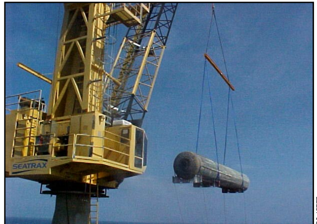
SwRI performed a dimensional assessment and investigated the mechanisms of failure for a buoyancy can design used in the Gulf of Mexico.