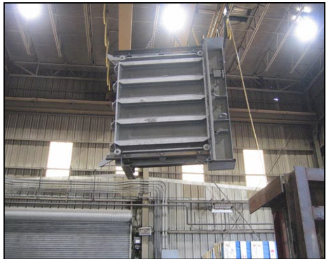
SwRI designed and built a custom pressure containment chamber to pressure test both sides of a water-tight door for a semi-submersible production platform.