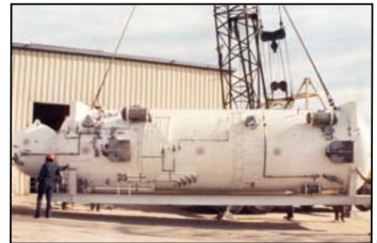
SwRI converted this deck decompression chamber from a double-lock to a triple-lock configuration and, through analysis, upgraded its rating from 900 to 1,200 feet of salt water (fsw).