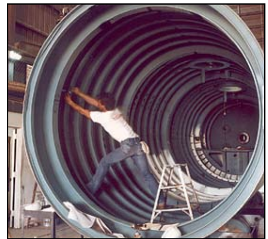
SwRI built the Kokanee submarine, the largest unmanned sub in the world (roughly 100 feet long and 10 feet in diameter), to simulate the acoustic and hydrodynamic characteristics of the Seawolf Class attack submarine. All its structures, foundations, and control panels were designed and fabricated at SwRI.