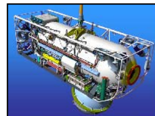
SwRI designed, fabricated and tested the pressure hull system, support frame and lifting bridle for the US Navy's new submarine rescue vessel, the Pressurized Rescue Module System (PRMS). To enable operation at depths of 2,000 fsw and to minimize system weight, HY-100 steel was used for the pressure hull systems. The lifting bridle was machined from a single 6Al-4V ELI (Grade 23) titanium alloy forging.